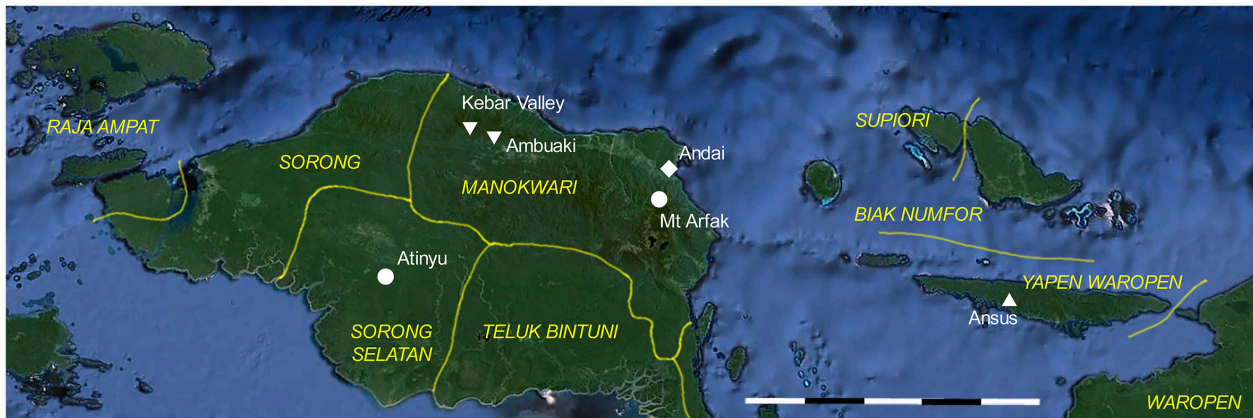
Fig. 1. Distribution of Calamophis on the Vogelkop Peninsula, West Papua Province, and Schouten Islands, Papua Province, West New Guinea. Titles in yellow italic font identify political entities (regencies) that are bordered by yellow lines. Titles in white font label collection localities. Species are indicated by symbols, including C. sharonbrooksae (circle), C. ruddelangi (downward triangle), C. katesandersae (diamond), and C. jobiensis (upward triangle). Scale = 200 km.

(David and Vogel, 1996). The fact that specimens from many parts of the world had become mixed with the Javanese specimens is clearly evident in the composition of Brachyorrhos , as the forms badius , flammigerus , schach , and torquatus are, in fact, South American taxa that are now placed in the genus Atractus . Adler (2012:80) provided additional examples of non-Asian snakes mixed in with Javan specimens in Heinrich Boie's collections. The species described as Brachyorrhos kuhli , which was earlier described as Coluber brachyurus by Kuhl (1820), is actually a specimen of Atractus trilineatus (fide Hoogmoed, 1982). This considerable confusion, caused by the arrival at the home country institution of specimens from far and wide, would present adequate grounds to doubt that the specimen of B. albus originated from Java.